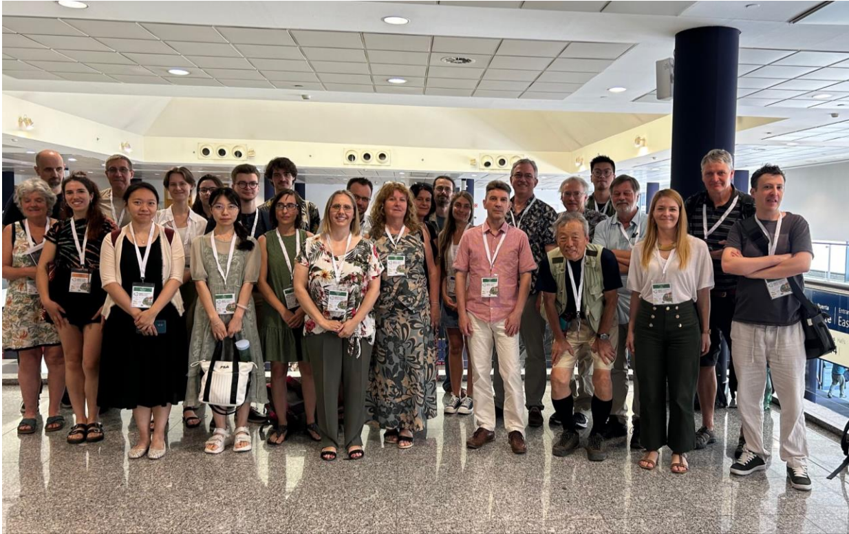
Organizers, speakers and some participants of the symposium “Plants in Fossil Lagerstätten” (group photo 2)