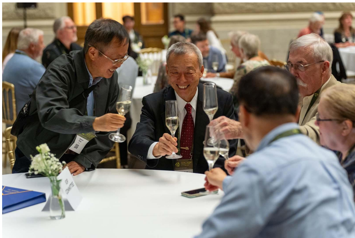
Congratulations and cheers!