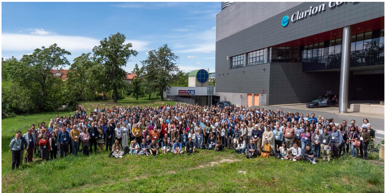
Group photo in front of the conference venue.