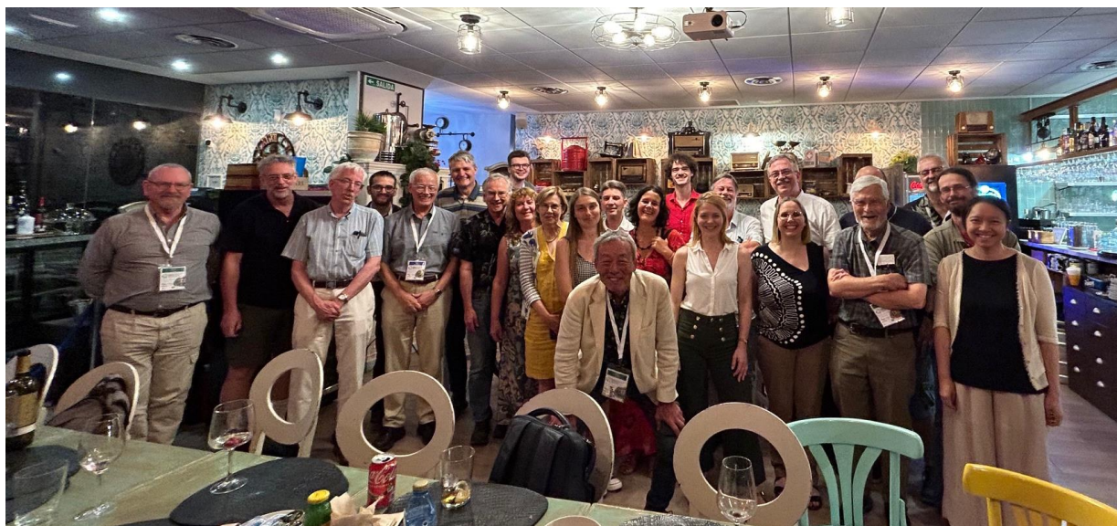
Participants of the IOP social gathering (group photo 1).

IOP celebrated its 70 th anniversary as separate organization. IOP was initiated and founded during the International Botanical Congress in Paris 1954. In occasion to celebrate this important date an informal gathering of IOP members and other colleagues from fossil plant sciences was organized in a restaurant (see group photo 2).