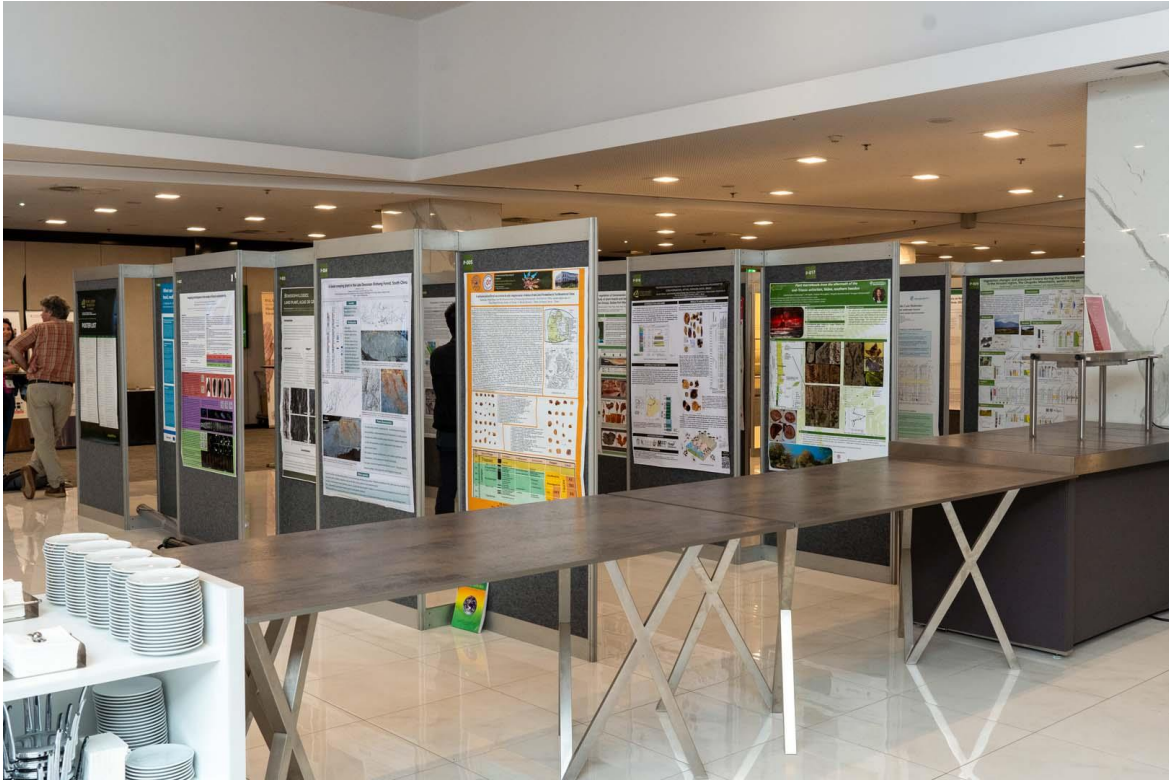
Poster area in the conference venue.