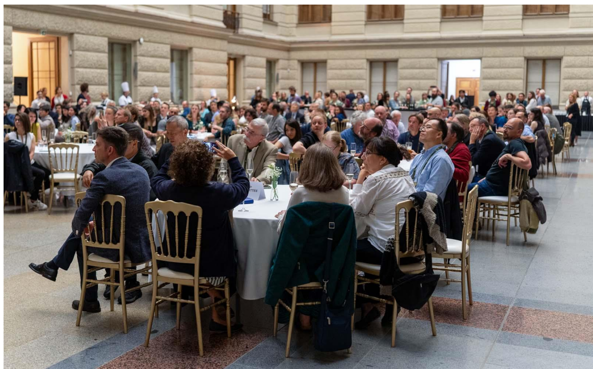
Gala dinner guests.