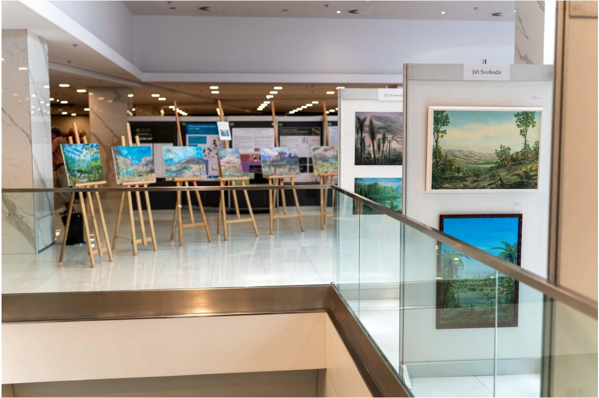
Palaeo-art exhibition in the conference venue.